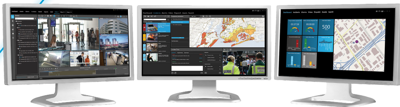
Combining multiple systems and information from numerous sources.