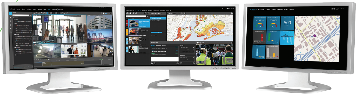
Combining multiple systems and information from numerous sources.