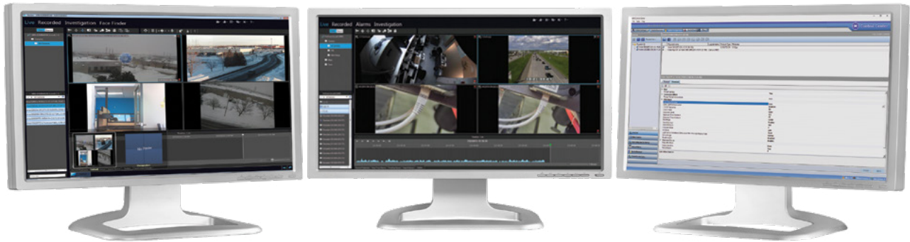
Comprehensive video monitoring, management and health awareness.